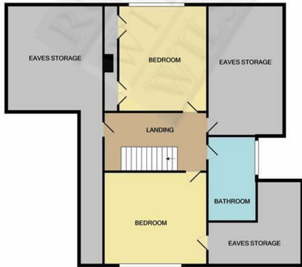
1ST FLOOR APPROX. FLOOR AREA 1180 SQ.FT. (109.7 SQ.M.)

TOTAL APPROX. FLOOR AREA 2936 SQ.FT. (272.7 SQ.M.)